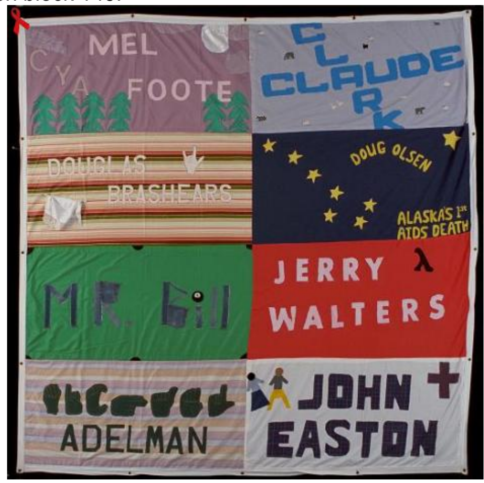
These are the names on Block # 149

Therefore, at Ray Of Hope Church Of Our Lord Jesus Christ, we continue to read aloud over 110,000 names sewn into the AIDS Memorial Quilt to keep HIV/AIDS in the conscious prayers of people. Scroll the page to see the panels on block 149.